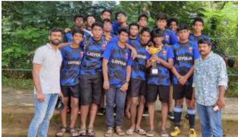
Runners-up in CISCE A Zone Football Tournament (Under 17)