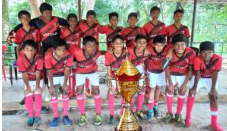
Winners in CISCE A Zone Football Tournament (Under 14)