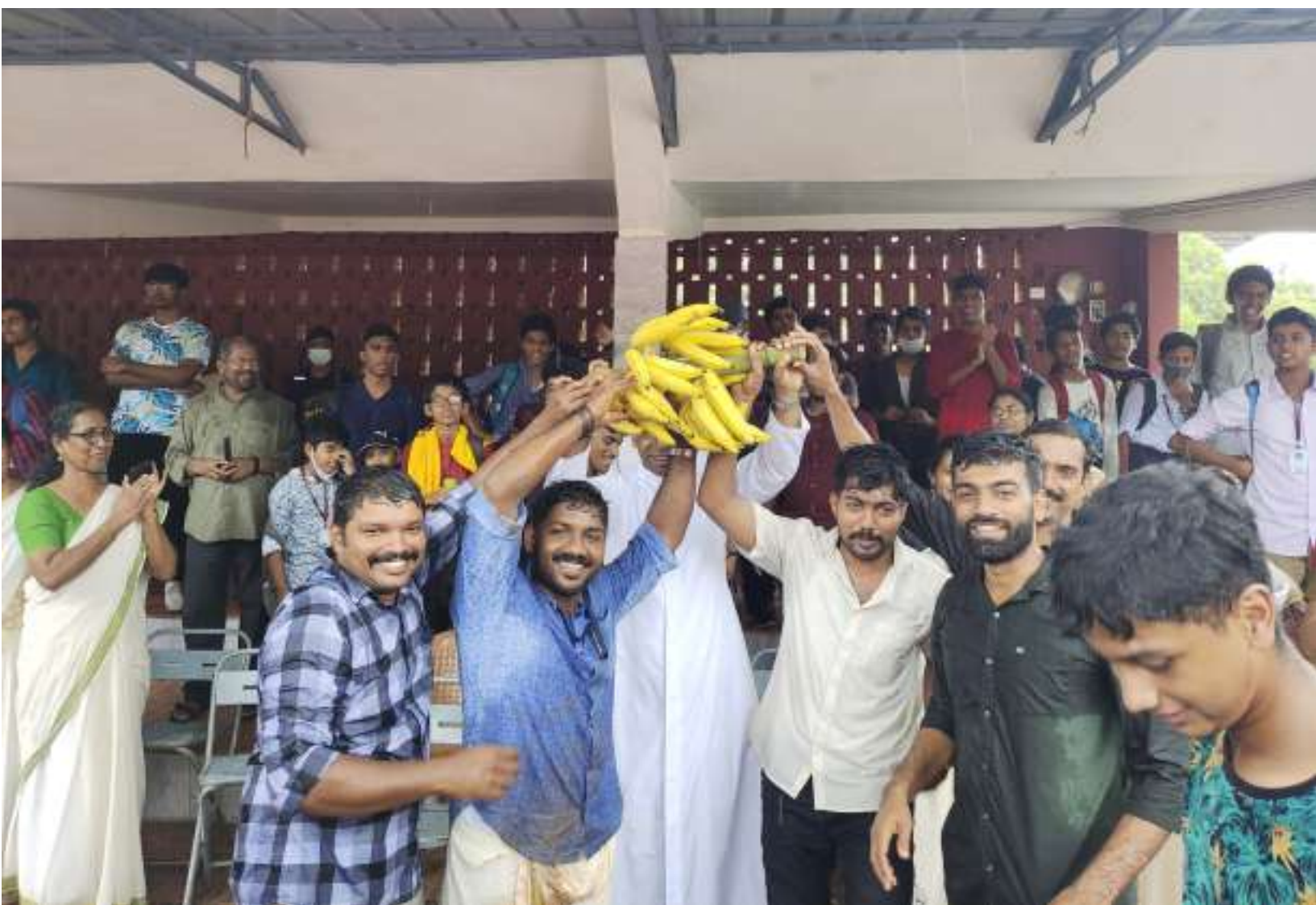
The drizzle didn't fizzle out their zeal; they battled it out and lifted the organic cup in the Onam edition of staff vs students cricket match.