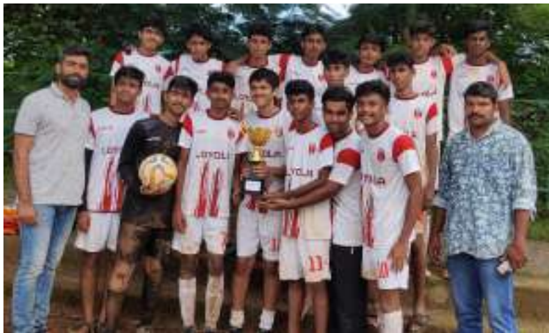
Runners-up in CISCE A Zone Football Tournament (Under 19)