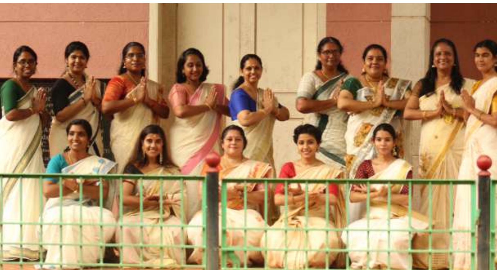
Last-minute fine-tuning of the mudras while waiting in the wings for the Thiruvathira dance performance