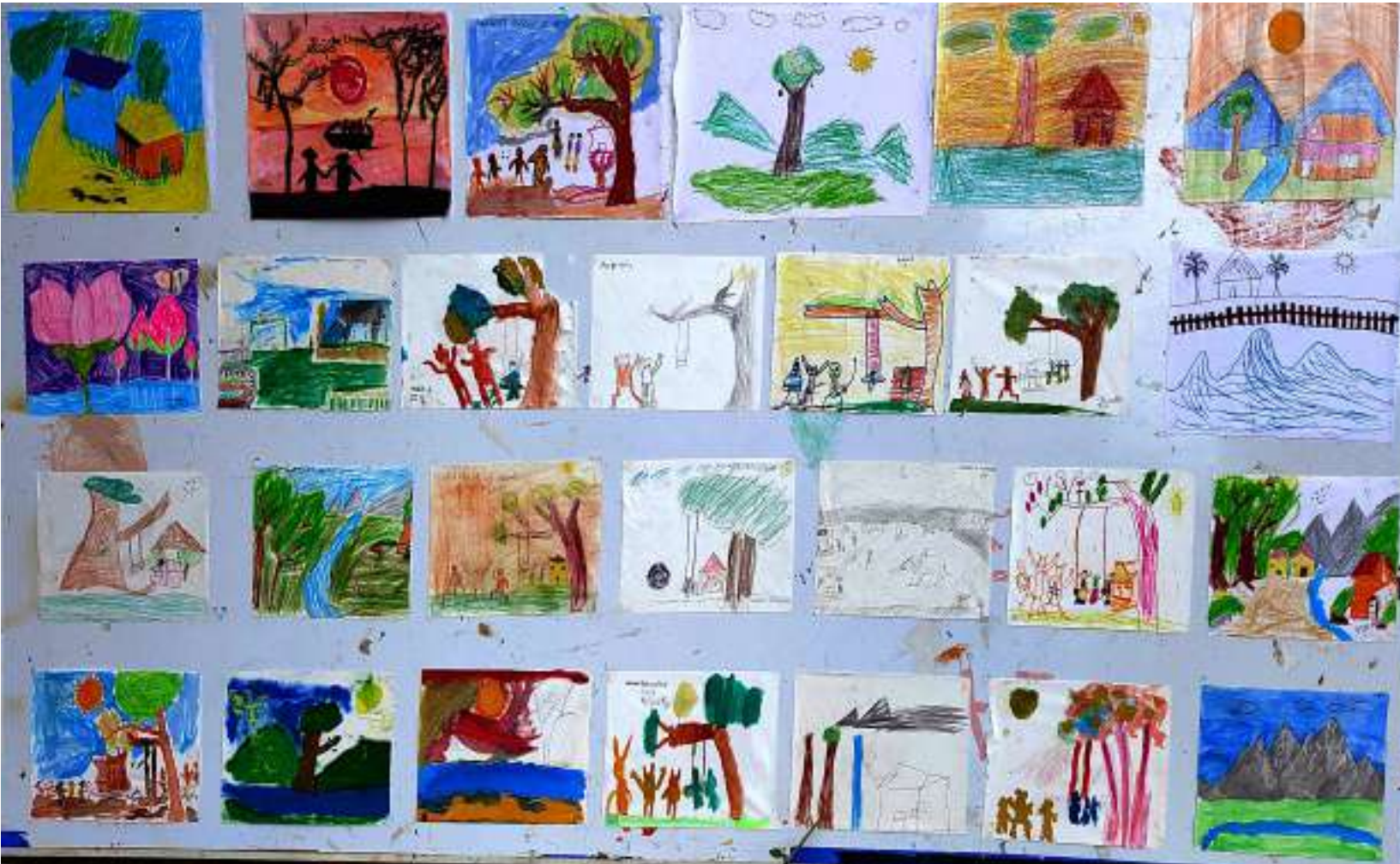
Adding a little more colour to the celebrations